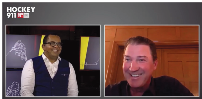
GREGORY CHARLES AND MARIO LEMIEUX DURING HOCKEY 911

Thank you to all our guests and to our generous partners without whom this event would not have taken place. For more information visit codelife.ca/hockey911 .